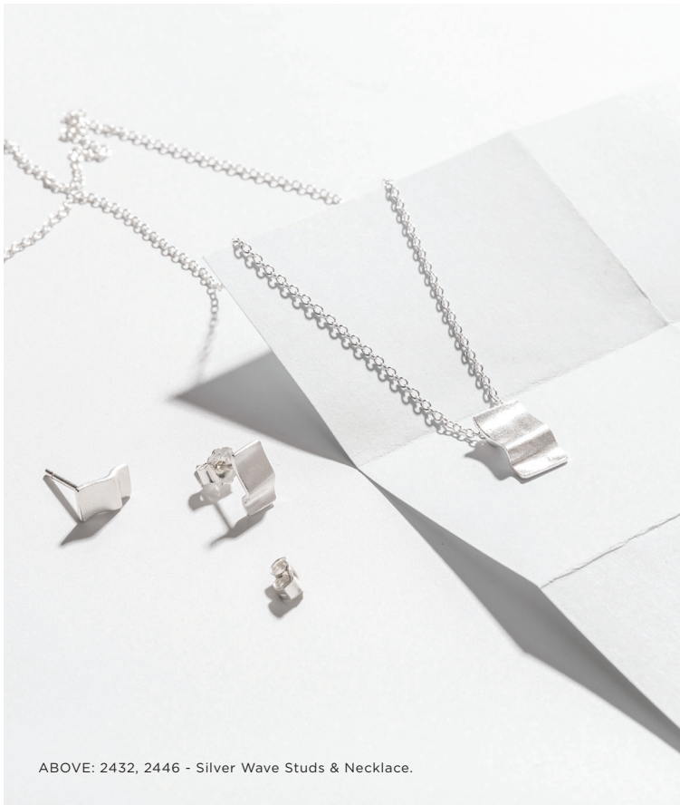
ABOVE: 2432, 2446 - Silver Wave Studs & Necklace.