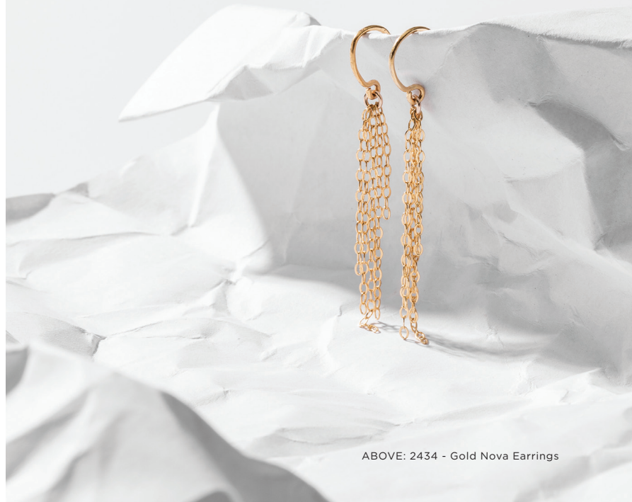
ABOVE: 2434 - Gold Nova Earrings

Handmade, Fine Chain & 18ct Gold Vermeil.